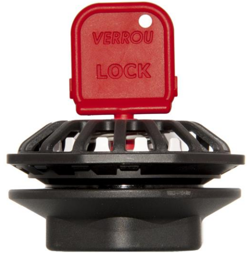
2110P HI-FLO RELIEF VALVE